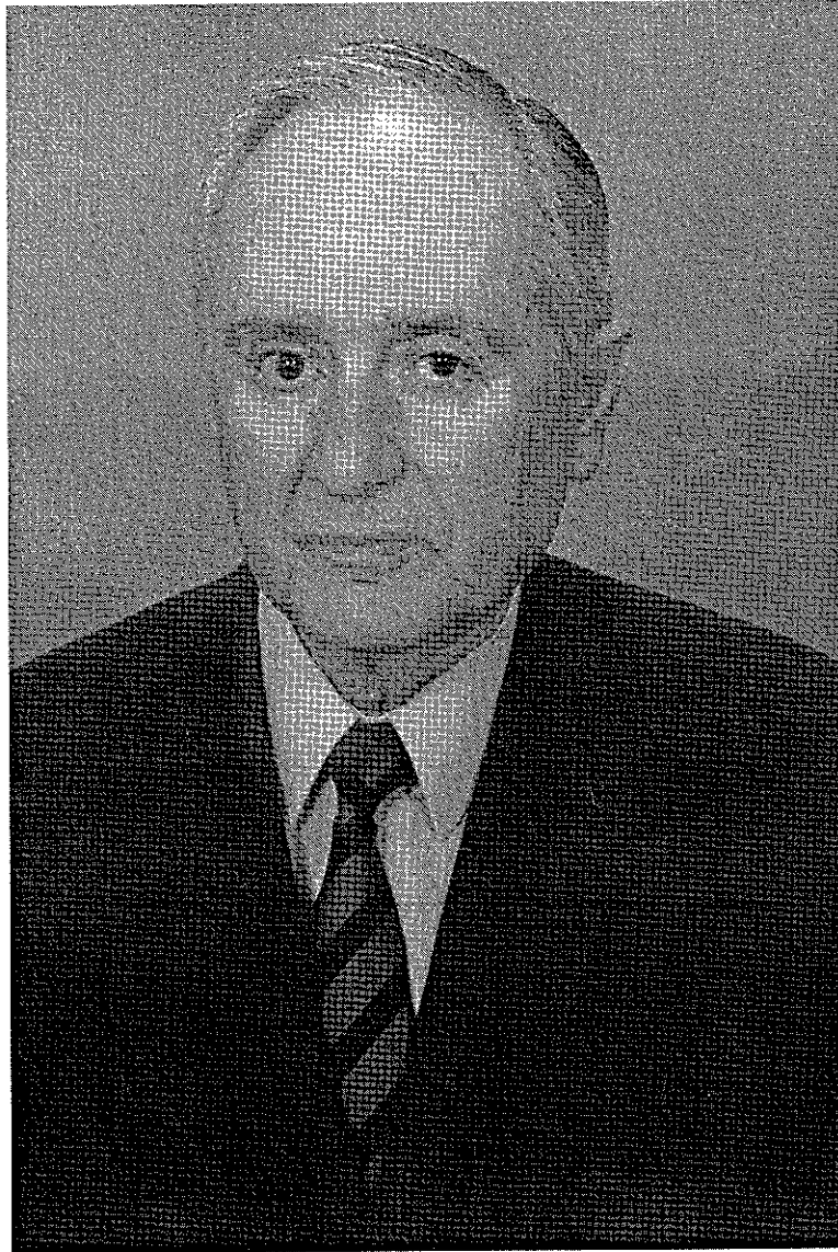
The author in 2001